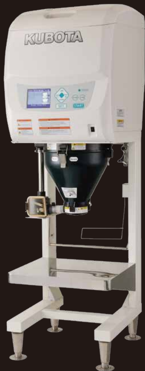
Models | KP720NA-UL (Rice stock quantity: 60kg)