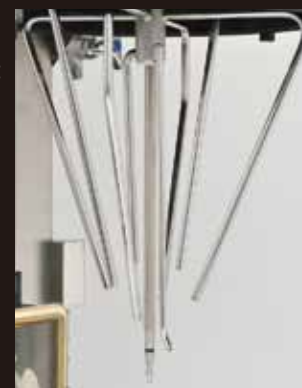
*The multi-angled Stirring Blade (Rice Washing Tank not shown)

The multi-angled design of the Stirring Blade ensures the rice is evenly stirred. The Bran – the hard outer layer of the grains of rice – is quickly and efficiently removed to contribute to efficient rice washing in a remarkably reduced amount of time.